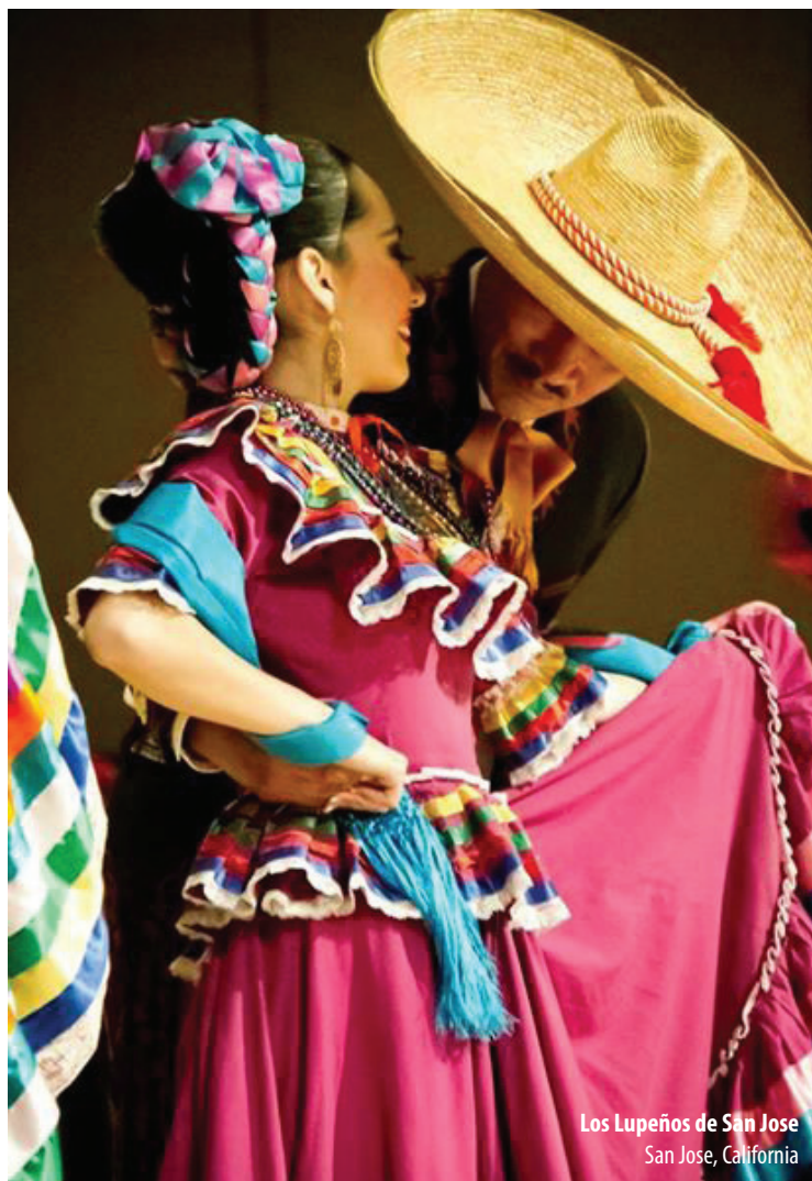
Los Lupeños de San Jose San Jose, California

Participants have the opportunity to explore local restaurants, learn about Mexico's folklórico history and culture by the best maestros from Mexico, review or learn new regional bailes y danzas, network with fellow danzantes, as well as venture into the numerous attractions with familiar and new friends and enjoy what Phoenix has to offer.